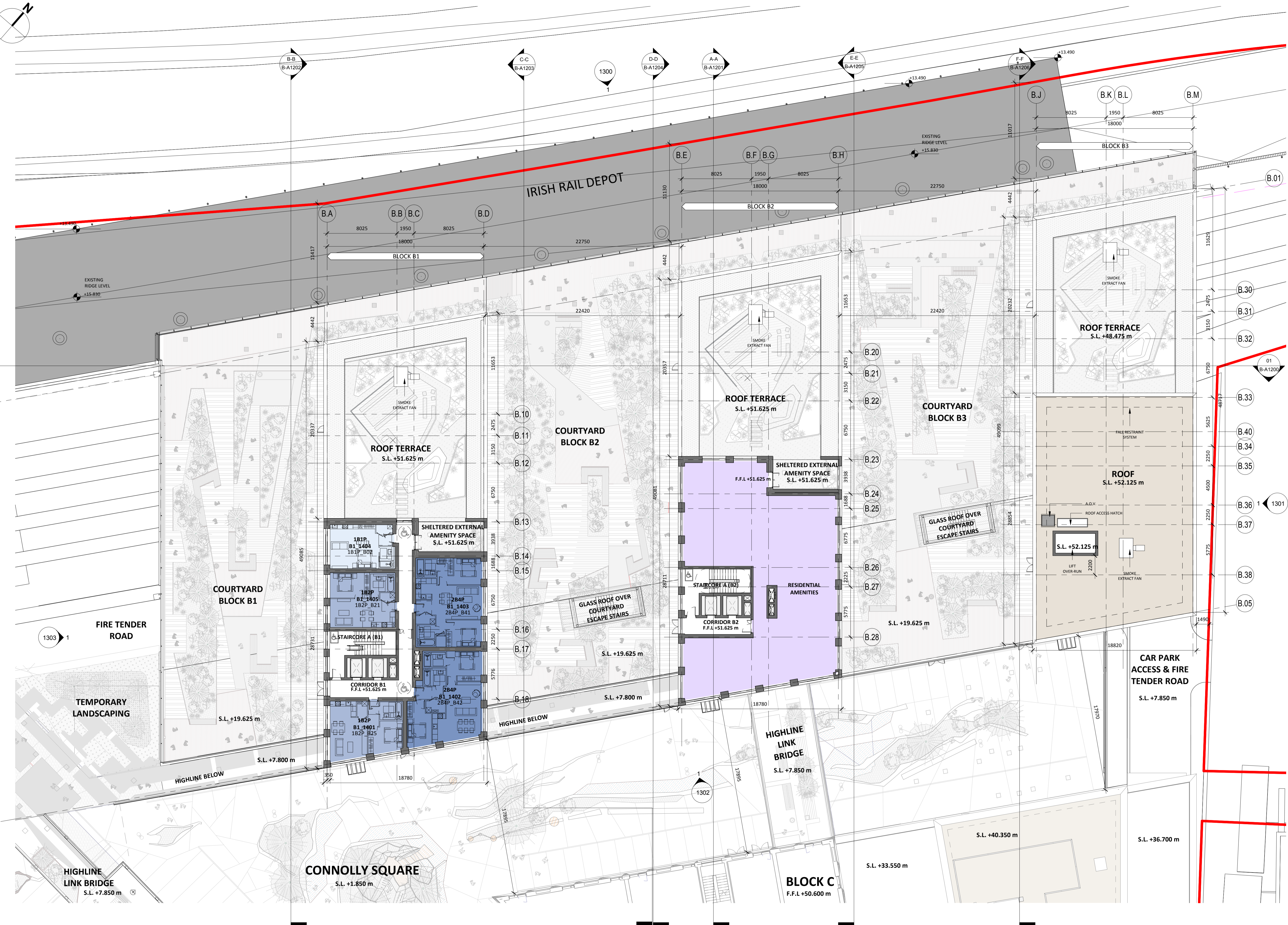
1 BLOCK B PLAN_LEVEL 14 1 : 200

ARROW Name: Farinagade 13, st th DK-1364 Copenhagen K Denmark +45 4236 2860 info@arrowarchitects.com www.arrowarchitects.com